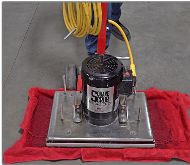
2. Place plate face down on a Xylene soaked towel for 30 min.