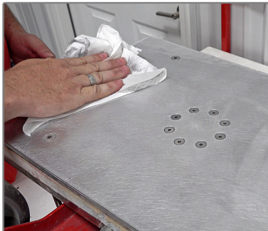
5. Clean the plate with 91% alcohol and a lint free cloth. Let plate dry for 5 min. Remaining steps should be done within 15 minutes of completing step 4.*