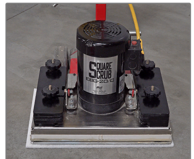
9. Set machine upright on a driver pad for 24 hrs with machine weights before using.