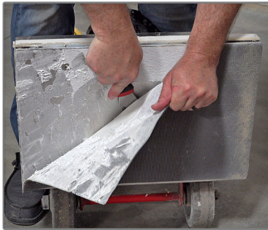
1. Remove old grip face from the plate.