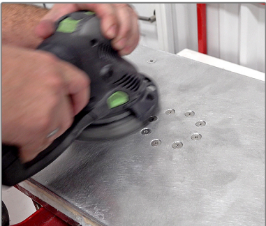
4. Abrade the plate using an orbital sander with 80 grit sandpaper to remove a very thin layer of aluminum evenly.