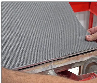
7. Evenly, line up the exposed area against the long edge of the plate.