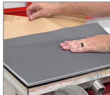
8. Smooth evenly, while slowly pulling the liner until completely removed and press firmly around all areas of the grip face.