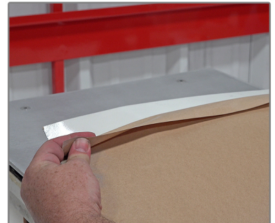
6. Remove back liner of the new grip face 2" from the long edge.